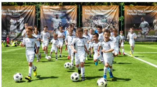
SPORT & FUN

Join us for an unforgettable family holiday this October at Forte Village! Get ready for a week packed with exciting sports, events, delicious food, and guaranteed fun for all ages. Don't miss out on the perfect blend of action, flavor, and fun this October!